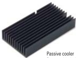
Passive cooler Part no. 805370