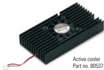
Active cooler Part no. 805371